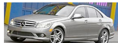
Entry-level luxury sedan | Photos, reviews Detroit Auto Show photos